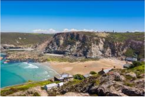
to ensure you find it easily.

Personal Itinerary A personal itinerary setting out each overnight stop, including large scale maps of each accommodation,