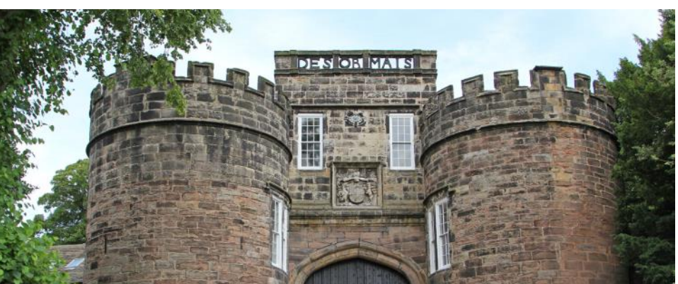
By Road: Very close to the M6 motorway, Penrith is also served by National Express Coaches

By Public Transport: You can take the train from Penrith to Carlisle, and from here it is easy to connect whether you are heading north, east or south. The train from Penrith back to Skipton takes around 2 and a half hours. Alternatively you could catch a bus to Appleby and then take the scenic Carlisle to Settle railway which continues on to Skipton.