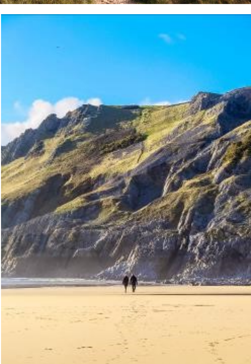
How to Book

Our holidays are designed to be flexible and can therefore be tailored to suit your requirements. If you're looking for something different, or extra, from the holidays described here, give us a ring and we'll do our best to please. You can start on any day you like and we can arrange extra nights at any of the overnight stops allowing for rest days, or giving you more time to explore the locality. You can book part of a walk if you don't have the time to complete the entire distance.